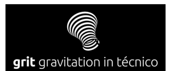
Logo Vertical E